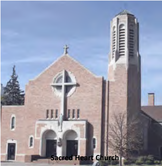
Sacred Heart Church

357 N Third Street, Baileyville, KS 66404