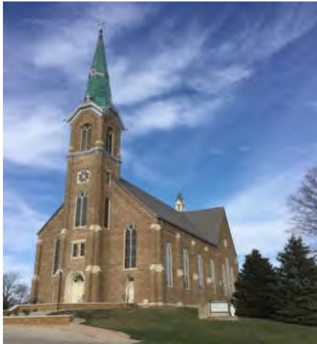
St. Mary's Church

9208 Main Street, St. Benedict, KS 66404